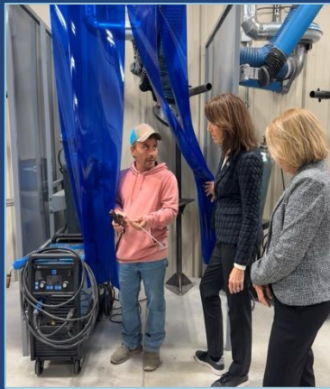
USDA Visit to NICC's New Welding Facility in Fall 2024

NICC has recently launched its first Bachelor's degree in Business Administration and Tribal Nation Building for the Fall 2023 semester. With a large number of business graduates, these alumni can now pursue their education close to home.