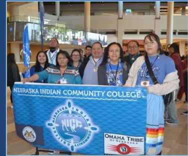
NICC Students attending the AIHEC Conference in March 2024z

In these rural areas, services may be limited. Key areas that require additional services include childcare, sustainable food, housing, healthcare, and industrial trades. In response, NICC has increased its course offerings and certificates, serving as stackable Associate and Bachelor's degree credentials. Businesses in reservation communities and surrounding rural and urban areas have teamed up with NICC to encourage employees to develop workforce skills and enhance their professional development.